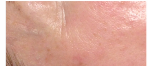
FEMALE, AGE 58 | 4 REJUVA PEN TREATMENTS