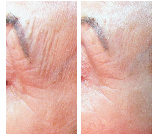
FEMALE, AGE 70 | 5 REJUVA PEN TREATMENTS